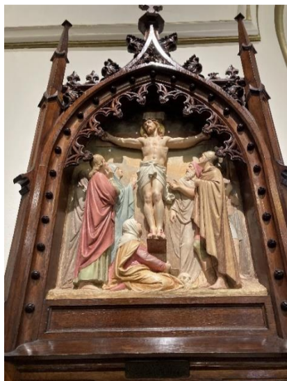
One of the restored French Stations of the Cross