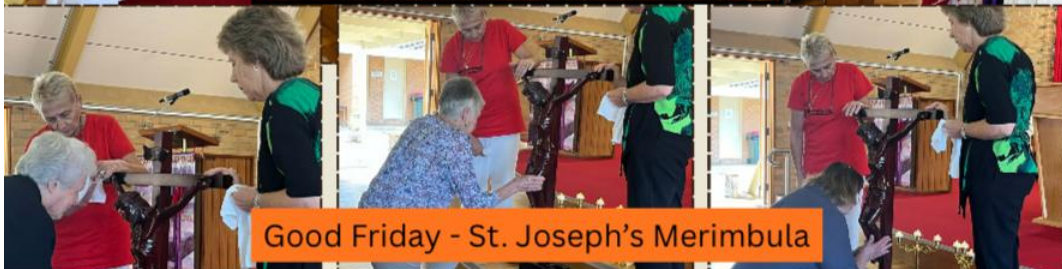
Good Friday - St. Joseph's Merimbula