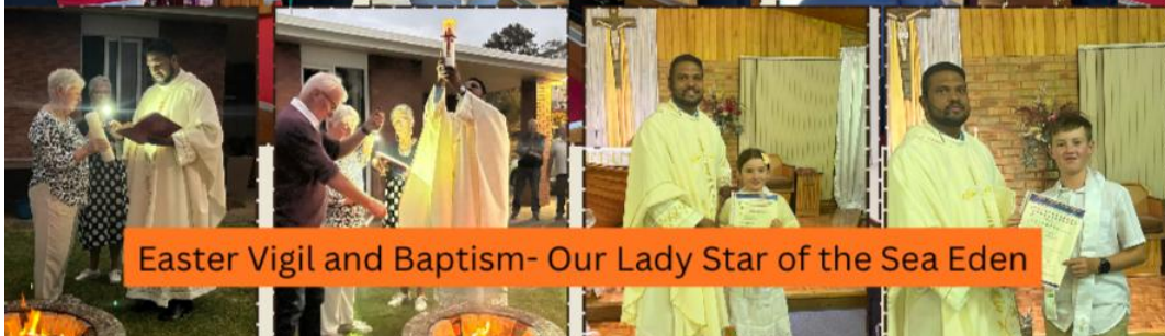
Easter Vigil and Baptism- Our Lady Star of the Sea Eden