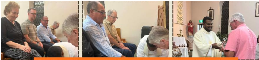
Washing of feet and giving of bread-St. Peter's Pambula